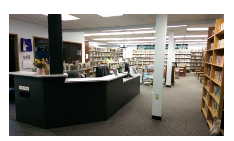
Flushing Area Library improvements

We upgraded our network to Fiber. The new Fiber connections are capable of handling significantly higher traffic between our branches and to the Internet. This upgrade helps meet our patrons' increasing internet demands, in addition to supporting access to the digital resources GDL provides.