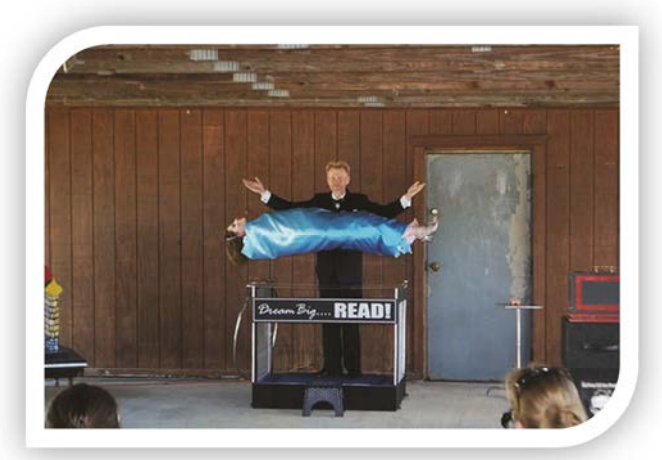
Summer Reading Program