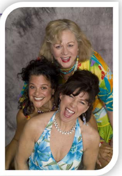
Boogie Woogie Babies